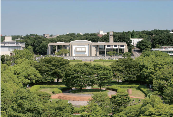
Toyoda Auditorium, Higashiyama Campus