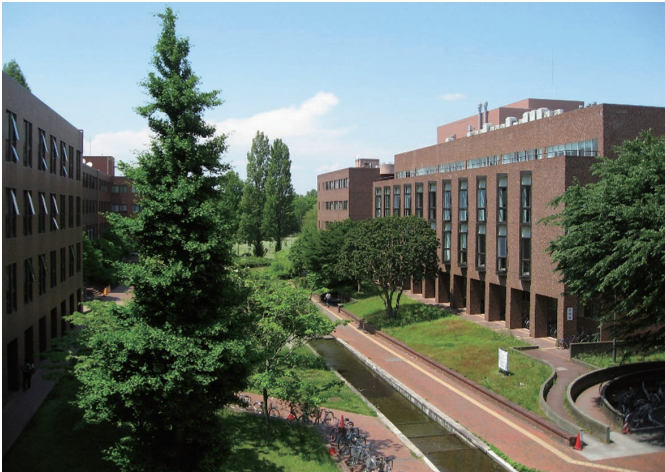
Central Area, Tsukuba Campus