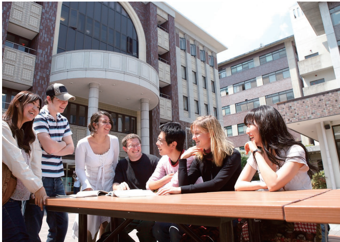
Koshinkan Building, Kinugasa Campus