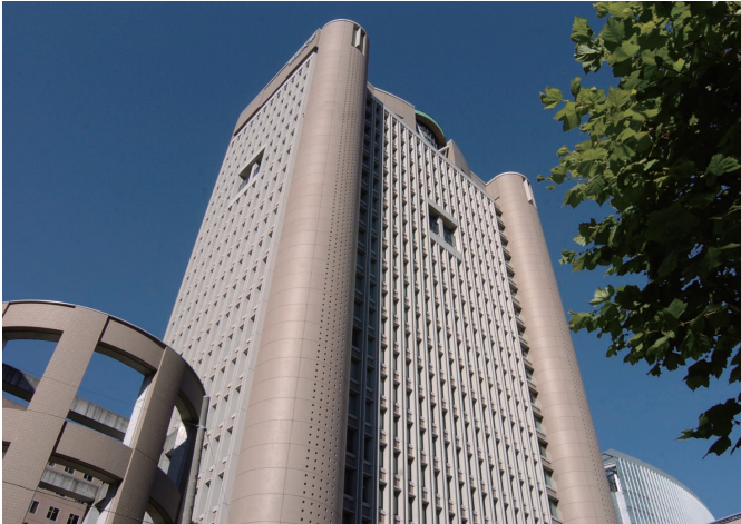
Liberty Tower, Surugadai Campus