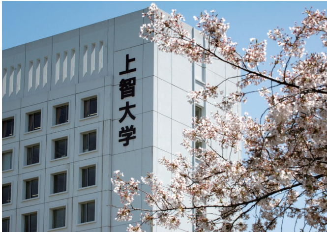
Bldg. No. 7 , Yotsuya Campus