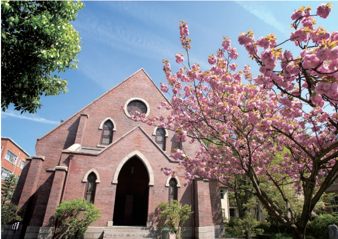
Chapel (A National Important Cultural Property), Imadegawa Campus