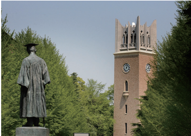
Okuma Auditorium, Waseda Campus