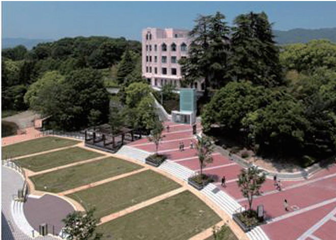
Osaka University Hall, Toyonaka Campus